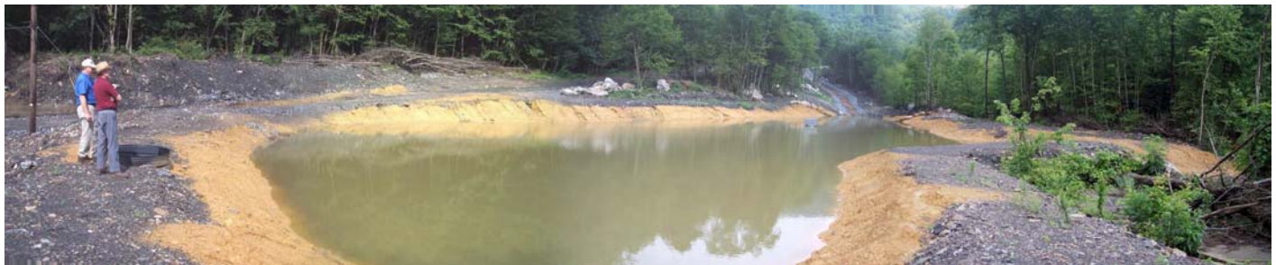
Dauphin County Conservation District staff overlooking the completed Lykens Water Level Tunnel Discharge Treatment System